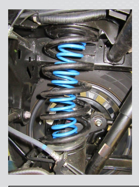
Rear Powerspring HV-314325